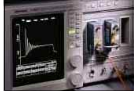
CD Laser Relaxation Oscillation with SD-43.

*6 Reference Receiver Performance (Opt. RR) 25° ±5°C.